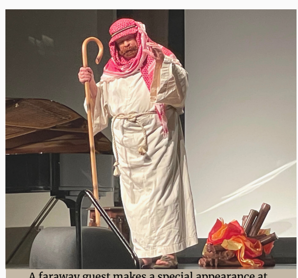
A faraway guest makes a special appearance at the Presidents' Bible Class