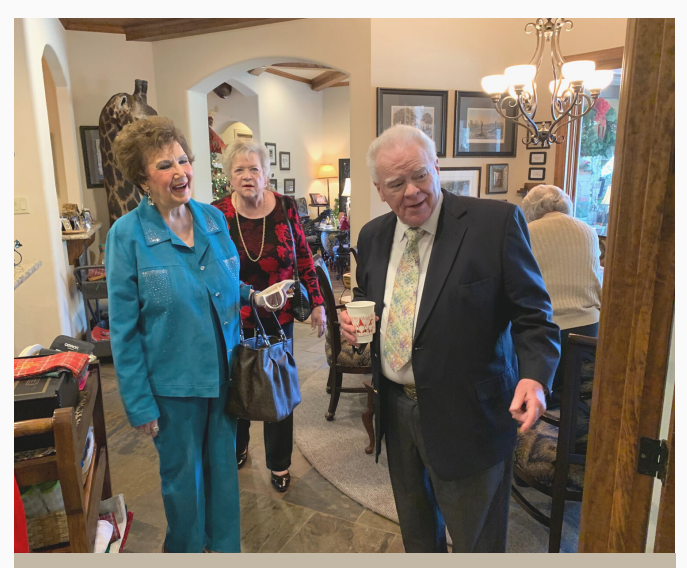
Presidents' Class Open House at the Hacienda