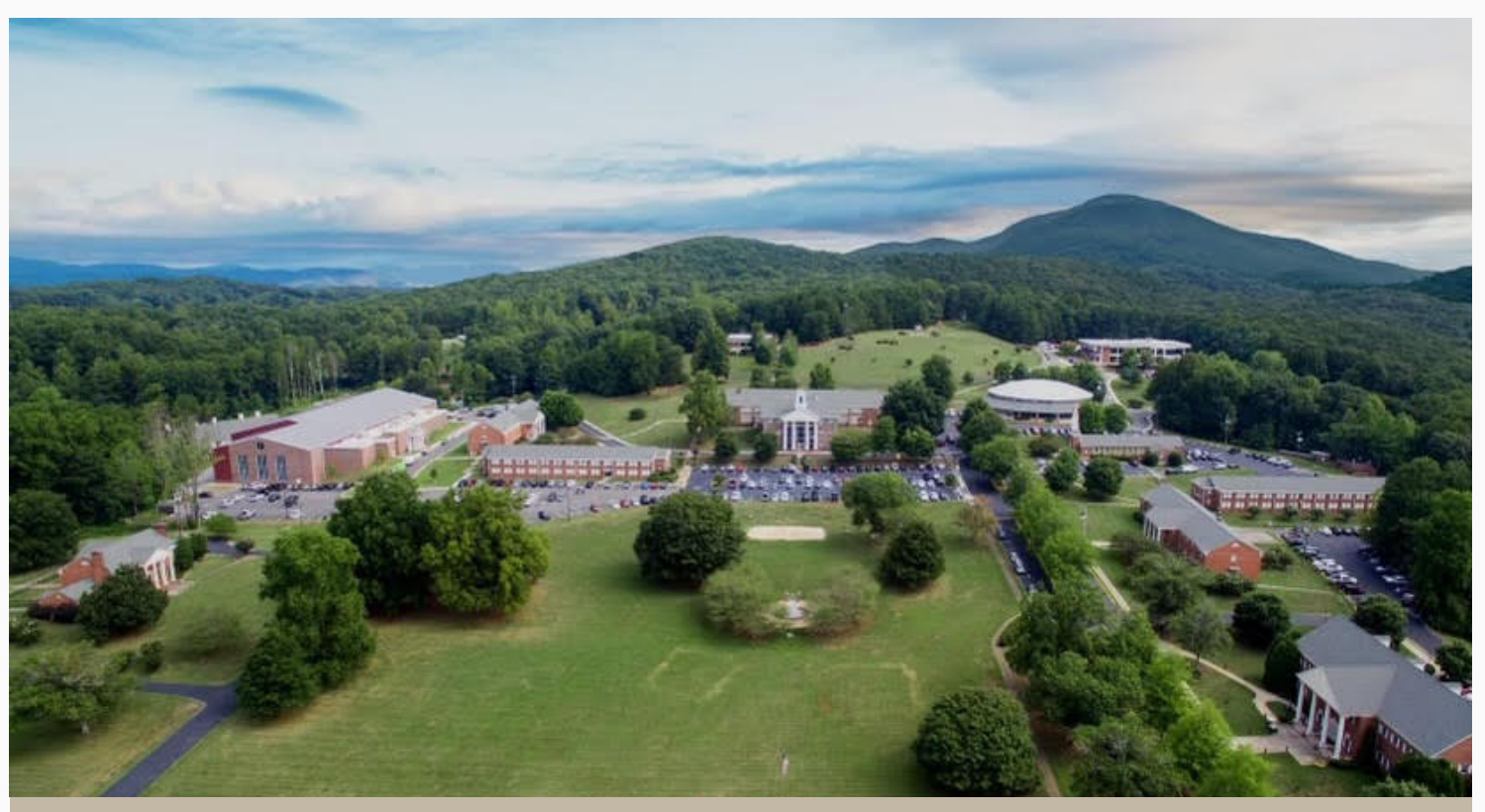
The beautiful campus of Truett McConnell University